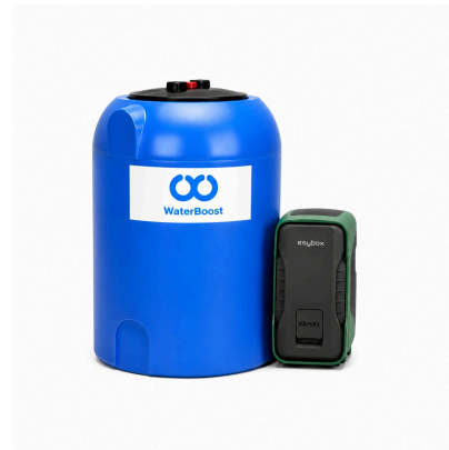
600 mm Ø × 650 mm High

The Esybox Pop pairs with DAB's new H2D app (iOS, Android, web) for remote monitoring, consumption tracking and configuration. Power Shower mode temporarily boosts pressure for a more intense shower — even with large rainfall heads — while keeping everyday consumption low.