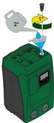
esybox Mini 3 — vertical installation

Pour clean water into the pump body — at least 2.2 litres for the esybox, or 1.5 litres for the esybox Mini 3.