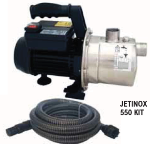
JETINOX 550 KIT