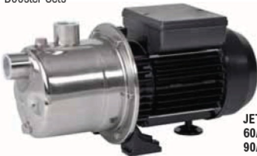
JETINOX 45/43 60/50 90/50