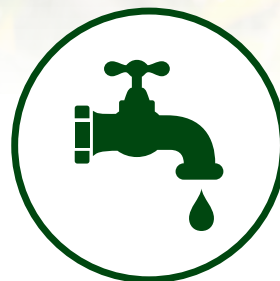
Sinks & Taps