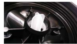
Removable filter cartridge centering plug