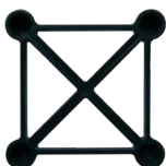
PRV protection plate for protection during shipping