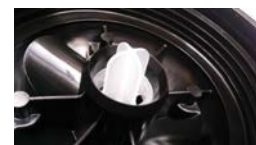
Removable filter cartridge centering plug