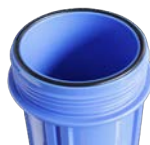
Single recess top mounted O-ring