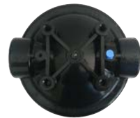
Housing cap mounting bolt hole design