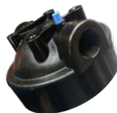
Housing cap with Pressure Relief Valve (PRV)