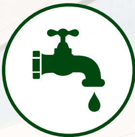
Sinks & Taps

Automatic pump system with a Category 5 AB air gap back flow protection.