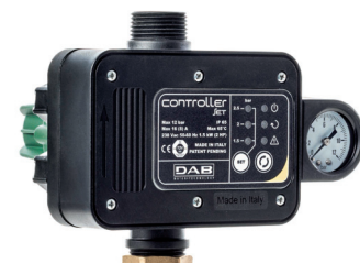
INTEGRATED TURBINE BOOSTER PUMP AND CONTROLLER

DAB PUMPS Limited Unit 4&5, Stortford Hall Ind Park, Dunmow Road, Bishops Stortford Herts CM23 5GZ